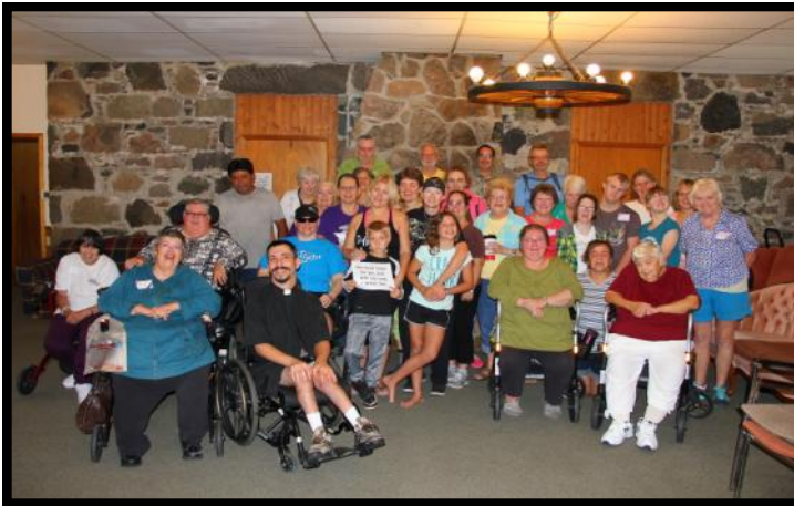
Building Community Retreat Participants

The Building Community Retreat was started in 1987 as a place for folks with disabilities and their families,